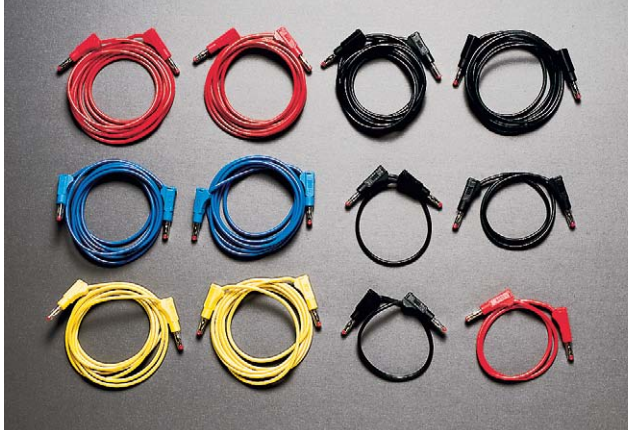
Cable set GA-00032