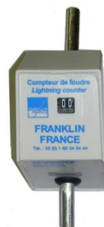
Lightning counter AFV0907CF