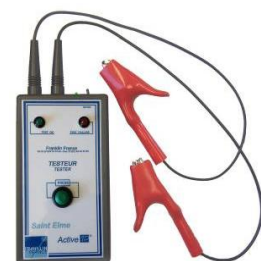
Wired tester AFV0050TT

This tester power supply operates with a battery (provided). The display with indicator lights indicates instantly the obtained result (positive or negative).