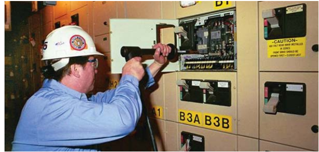
MCCB testing using the HCP2000