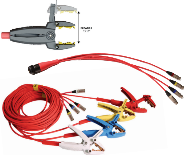
Available in 9 m (30 ft), 18 m (60 ft) and 30 m (100 ft) lengths

Newly designed test leads, shown in image below, are universal and can be used for winding resistance (MTO3XX) or turns ratio (TTR3XX) instruments. Expandable jaws, shown in inset, allow for testing any size transformer.