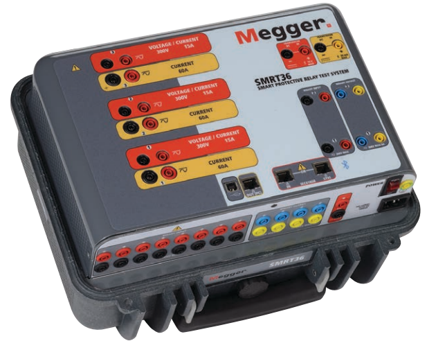
SMRT36 with optional Transducer hardware