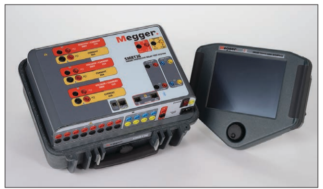
SMRT36 with STVI

For full automatic testing the SMRT36 may be controlled by Megger Advanced Visual Test Software (AVTS). AVTS is a Microsoft<sup>®</sup> Windows<sup>®</sup> XP<sup>®</sup>/Vista<sup>TM</sup>/7 compatible software program designed to manage all aspects of protective relay testing using the new Megger SMRT.