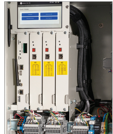
Location of maximum 3 x add-on cards

*** Time Response (typical): % of value after 1 measurement cycle.